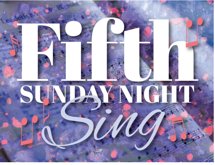
Sunday, September 29 at 6:00 PM Community Event

Grades 1 to 12 Begins on Wednesday, September 18 6:00 PM Bible Study—Supper—Games—Fun